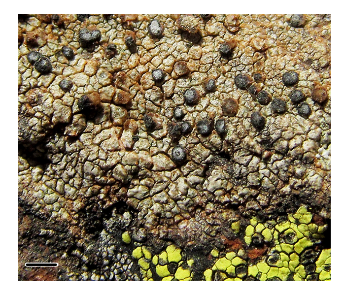
Fig. 2. Sarcogyne sekikaica (holotype). Scale: 1 mm.